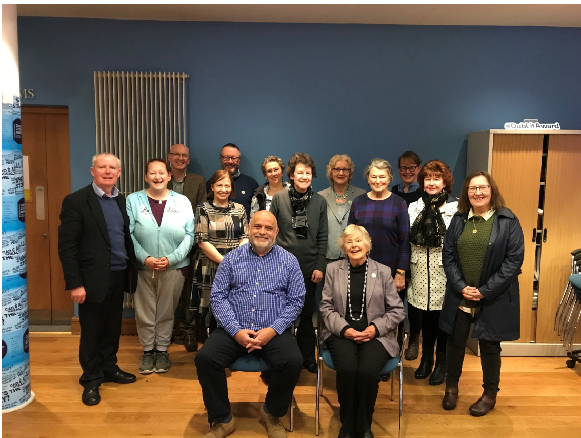
AGI members at the AGM in Dublin